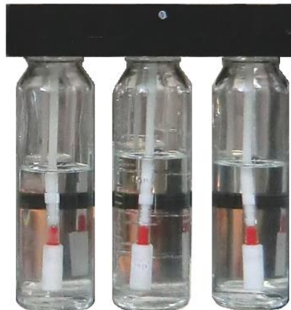
Assembled bottle array for NaOH solution