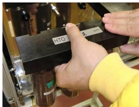
Insertion of the holder with sampling bottles with silica gel