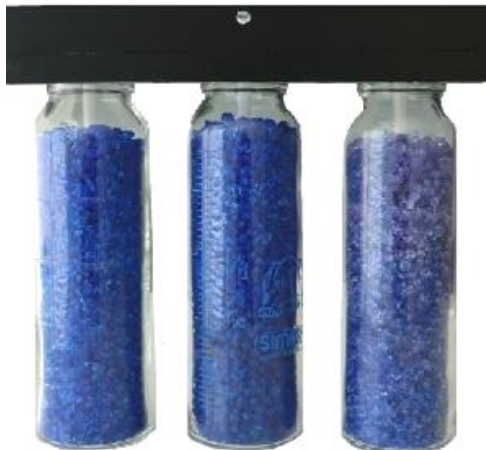
Assembled bottle array for silica gel