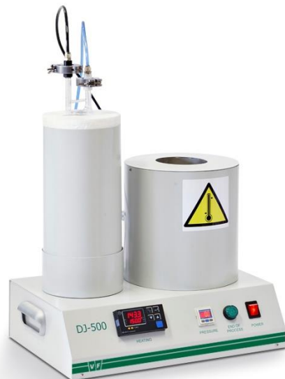
DJ-500 Desorption Unit