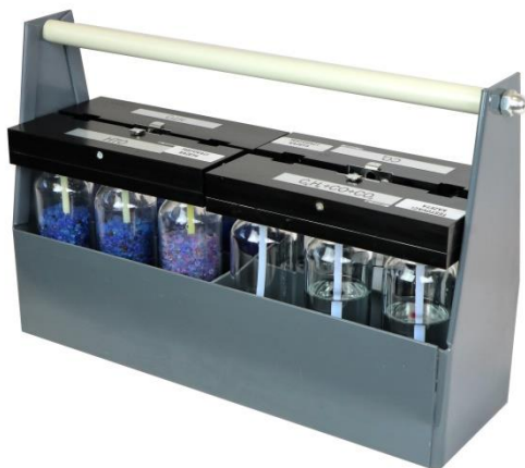
Transport box for sampling bottles in the holders