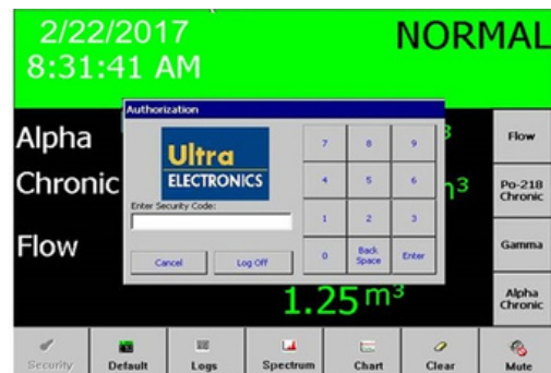
Passcode protected interface

In operation, the SmartCAM continuously monitors Alpha and Beta particulates deposited on a filter with a high efficiency detector. Air is drawn through the filter by an external vacuum pump or distributed vacuum main.