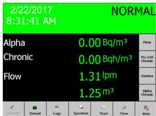
Simple to navigate touchscreen