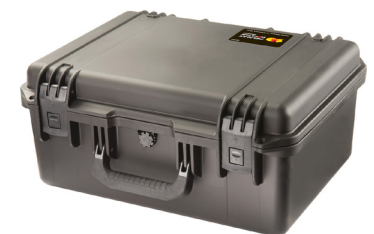
Transport & Storage Case Option

NOTE: This instrument is considered HAZMAT and requires HAZMAT training to ship. Please see the instrument manual for details.