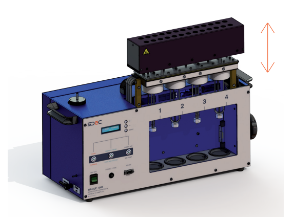
Dynamic opening cabinet of HAGUE 7000