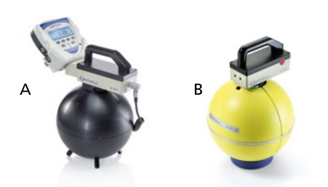
Figure 1: Different versions of the LB 6411. A: Mobile measuring system setup connected to the LB 134 Umo II Universal Monitor. B: LB 6411-Pb version for high energy applications

The probe is characterized by an extremely high sensitivity of approx. 3 pulses per nSv, more than 5-times better vs. detectors with conventional design. This was achieved by the relatively large detector volume and a special gas filling of the proton counter tube. Thus, additional recoil protons are produced in the counting gas, resulting in enhanced sensitivity.